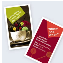
Creditcard size card