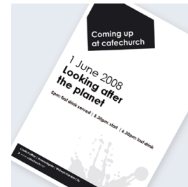
B&W A4/A6 flyer